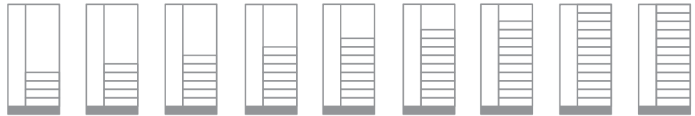
LITE 30 LITE 37.5 LITE 45 LITE 52.5 LITE 60 LITE 67.5 LITE 75 LITE 82.5 LITE 90